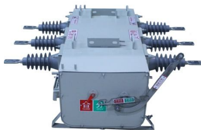
Fig.2) Outgoing line of silicone rubber bushing