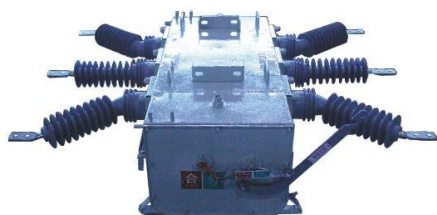
Fig.3) Outgoing line of silicone rubber bushing (anchor)